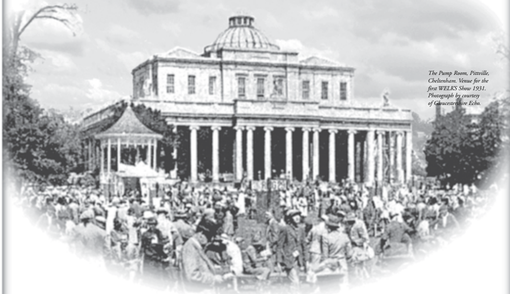
The Pump Room, Pittville, Cheltenham. Venue for the first WELKS Show 1931.